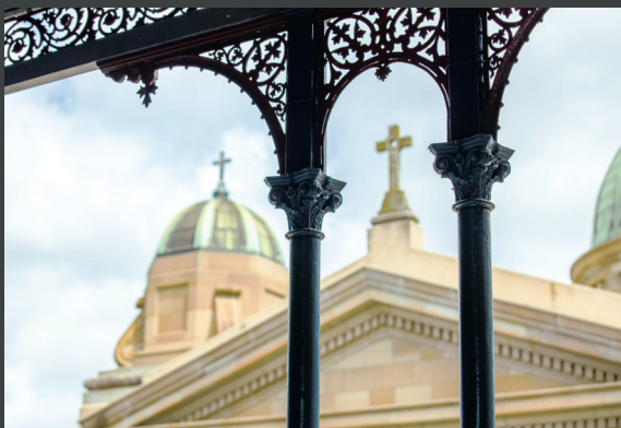
Above top: capitals missing from lace work Above: capitals replaced